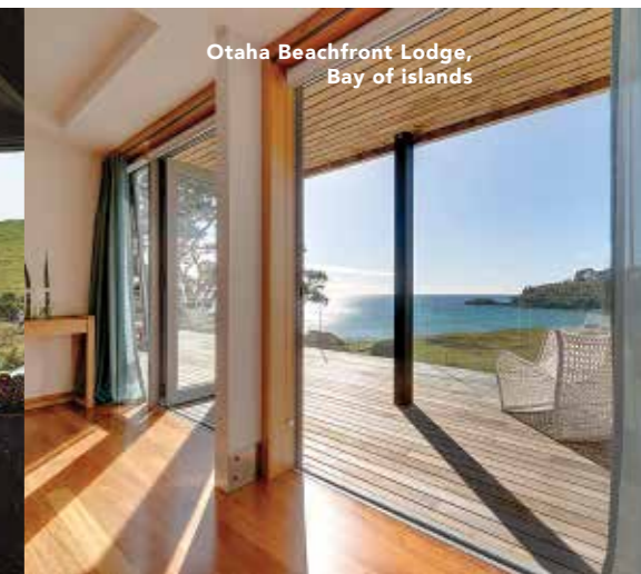
Otaha Beachfront Lodge, Bay of Islands