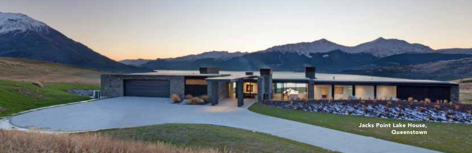
Jacks Point Lake House, Queenstown