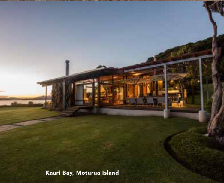
Kauri Bay, Moturua Island