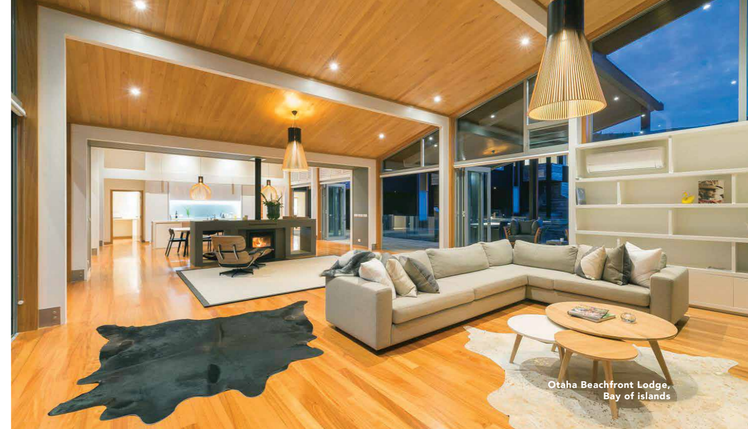
Otaha Beachfront Lodge, Bay of Islands

They are just going to keep getting bigger and better, a bit like super yachts! That is why we have now launched our Residence Collection - the very finest luxury accommodation available throughout New Zealand. Ranging from NZ$5,000 to NZ$35,000 per night these properties are set to rival some of the very best throughout the world. It's a very exciting time for Touch of Spice!